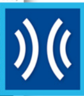
The Learning Ally Audiobooks App