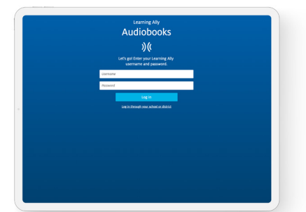
1. Log in with your Learning Ally username and password. If you log in with single sign-on (SSO) credentials, select Sign on Through Your School or District or access the audiobook app through your single sign-on provider portal.